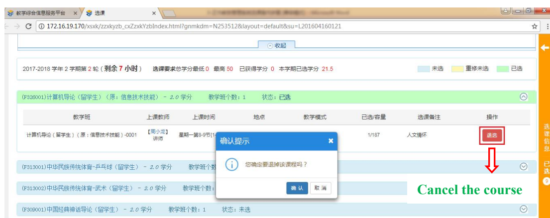
图 9 退课