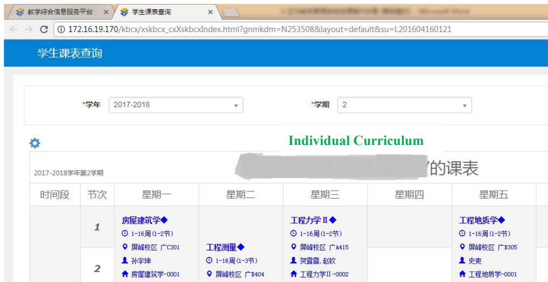
图 3 学生课表查询界面