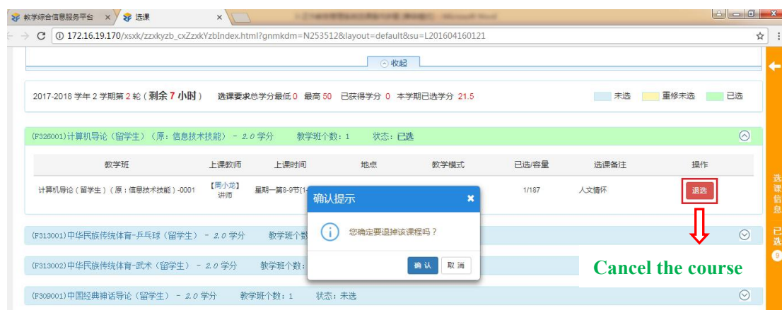
图 9 退课