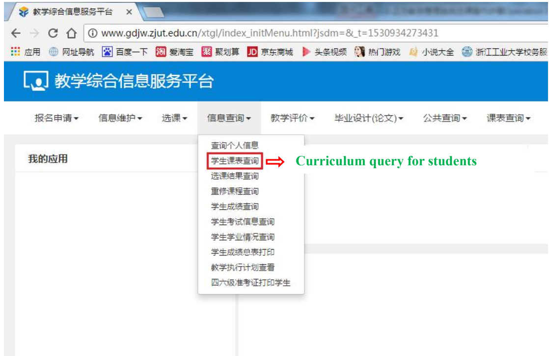
图 2 信息查询菜单界面

Click the “Curriculum query for students” under the Menu of “Information query” (FIG. 2); Choose the semester; Click “Search” Button for individual curriculum (FIG. 3).