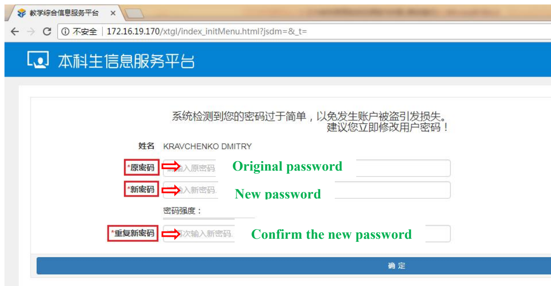
图 1 修改初始密码界面

After logging in, you are required to change the password(FIG. 1); Then enter the User Home.