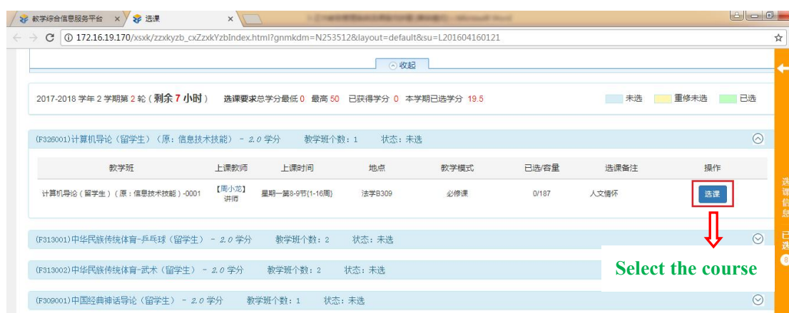
图 8 选课

Step 3: Select (FIG. 8) or cancel (FIG. 9) the courses in the list of available courses.